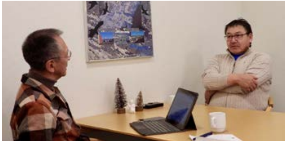
Søren Stach Nielsen interviewing Minister of Fisheries and Hunting Karl Tobiassen.