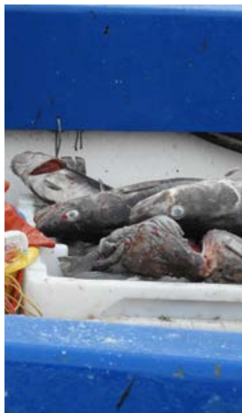
Husband and wife fishing and hunting between Aasiaat and Akunnaaq.

I will highlight two recommendations of the Manaus Letter that could be especially useful at the site of my fieldwork: #1 - Initiatives should be constructed from the bottom up, incorporating local as well as academic visions and knowledge; and #38 - Methodologies and materials for participatory monitoring, including species identification guides, information management systems and best practices in monitoring and management should be made broadly available.