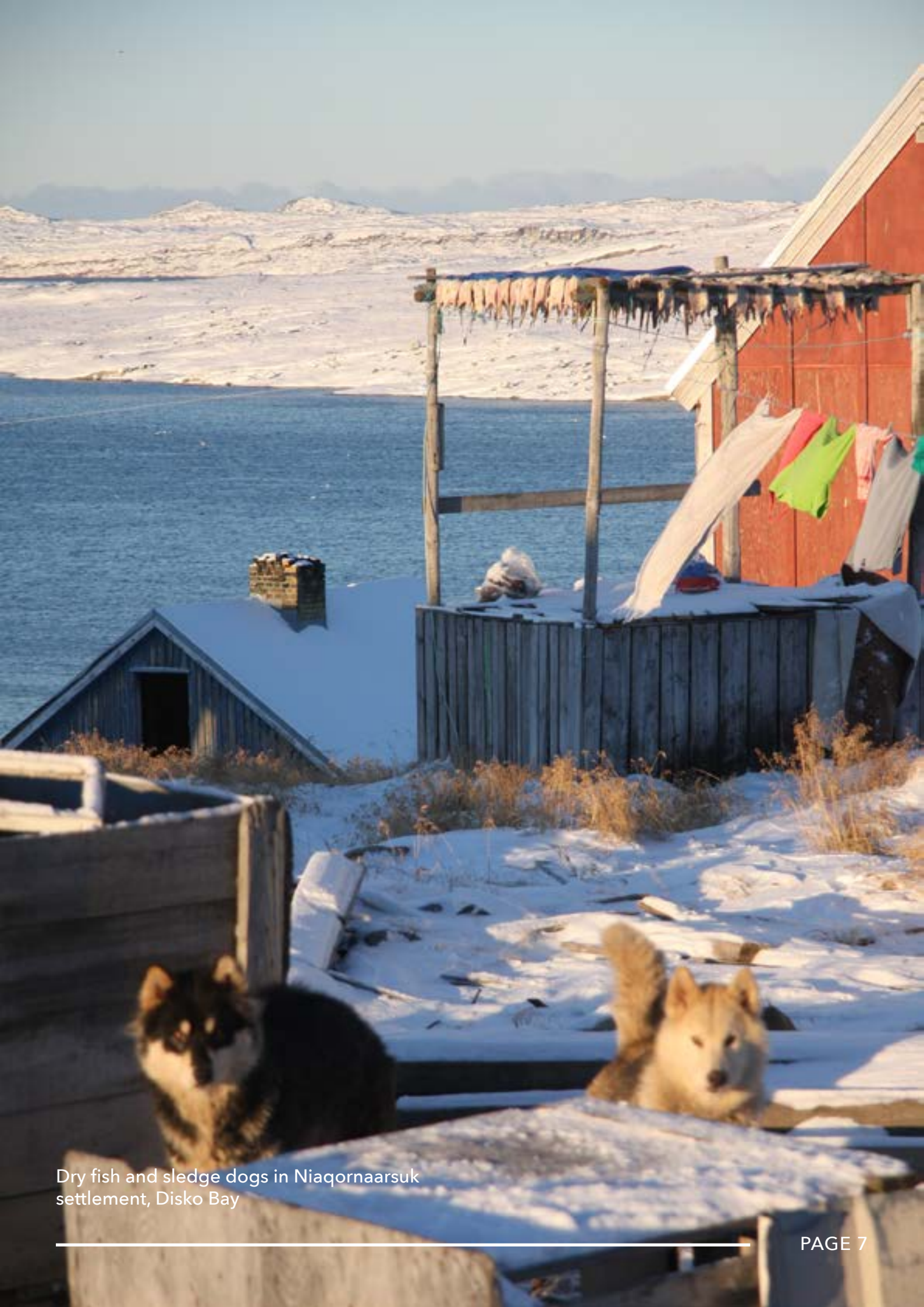
Dry fish and sled dogs in Niaqornaarsuk settlement, Disko Bay