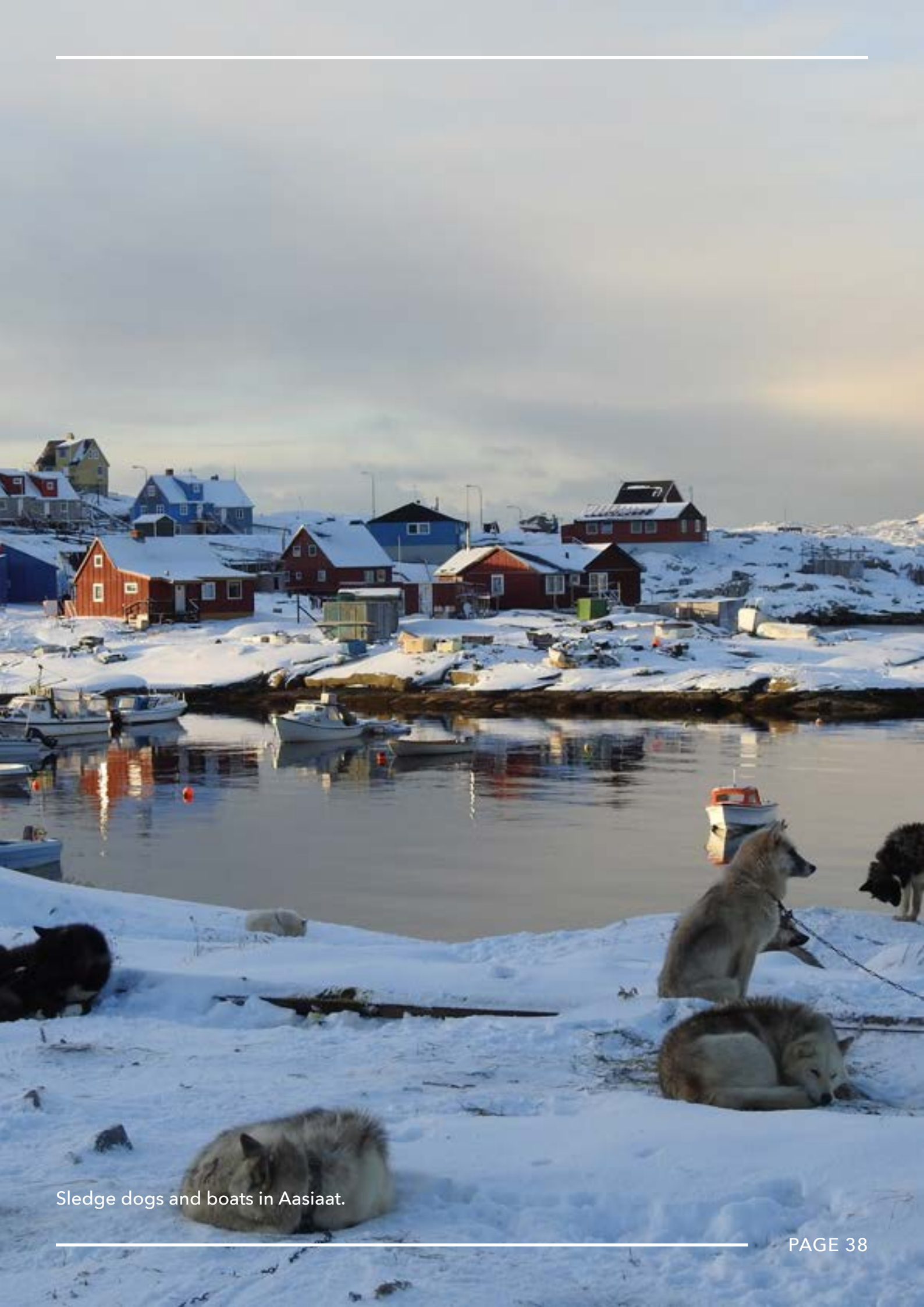
Sledge dogs and boats in Aasiaat.