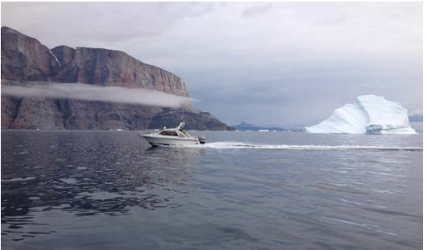
The sea near Uummannaq.

Amalie Jessen : Following up on Nuunoq's comment. There is more hunting of walrus now after recommendation from the hunters.