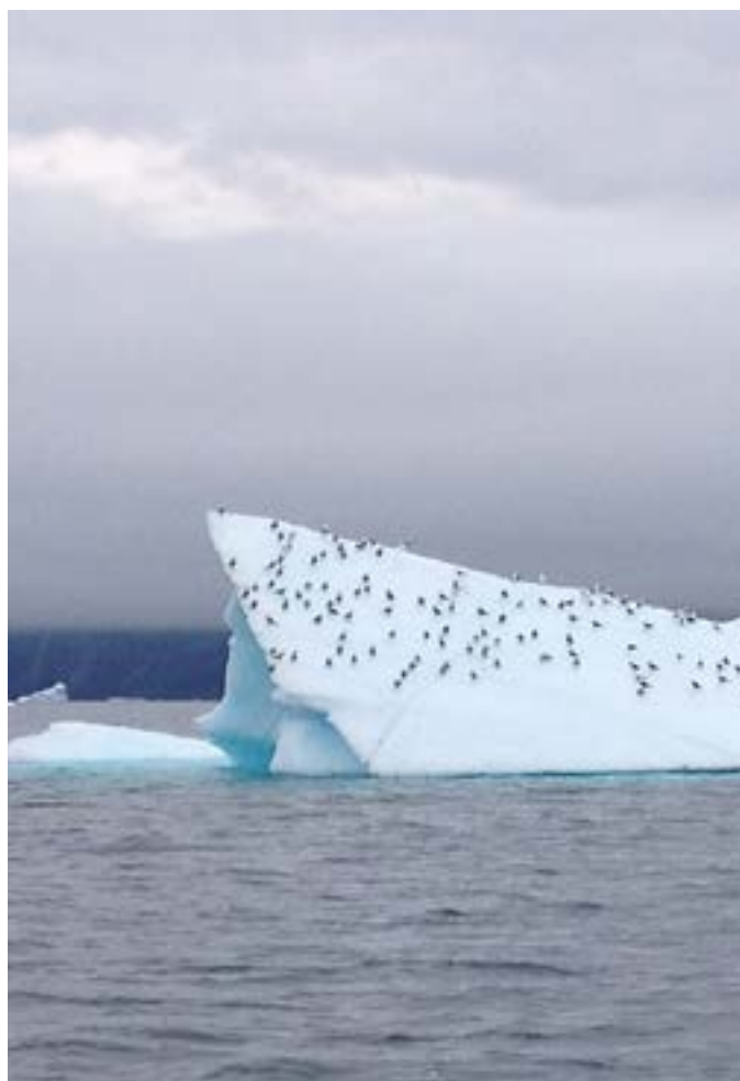
Kittiwakes on iceberg.